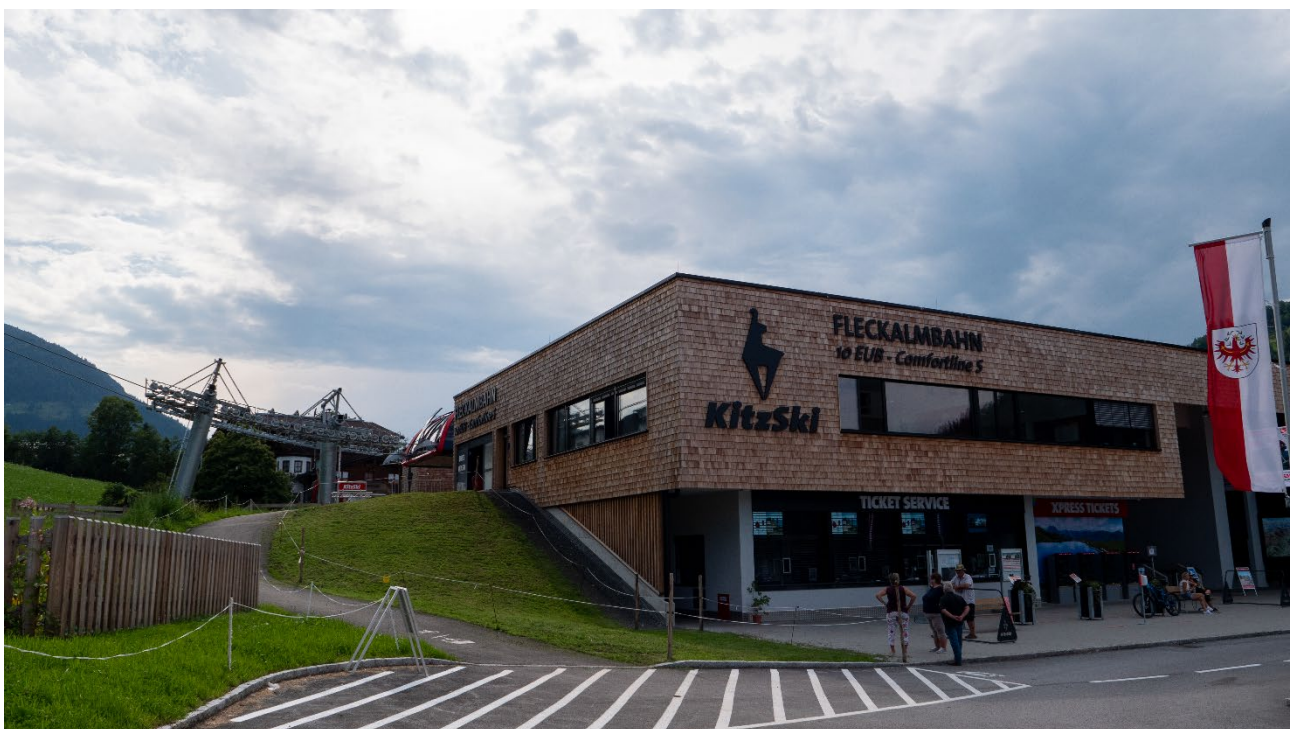
Figure 1: With the new construction of the Fleckalmbahn, the second most important feeder cableway into the core ski area of Kitzbühel was modernized.

After 90,000 operating hours, 30.5 million passengers and 35 years of accident-free operation, the Fleckalmbahn in Kirchberg in Tyrol, built in 1984, was retired in spring 2019. The requirements for the new construction were clearly defined by Bergbahnen AG Kitzbühel: Sustainable and responsible capacity dimensioning. Under the motto "Much better, not bigger", the new Fleckalmbahn was to be built as the second most important feeder cableway into the core ski area.